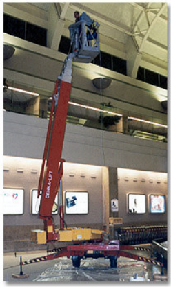
DENKA LIFT DL77

NOTE: Nationwide rates $ vary depending on length of rental